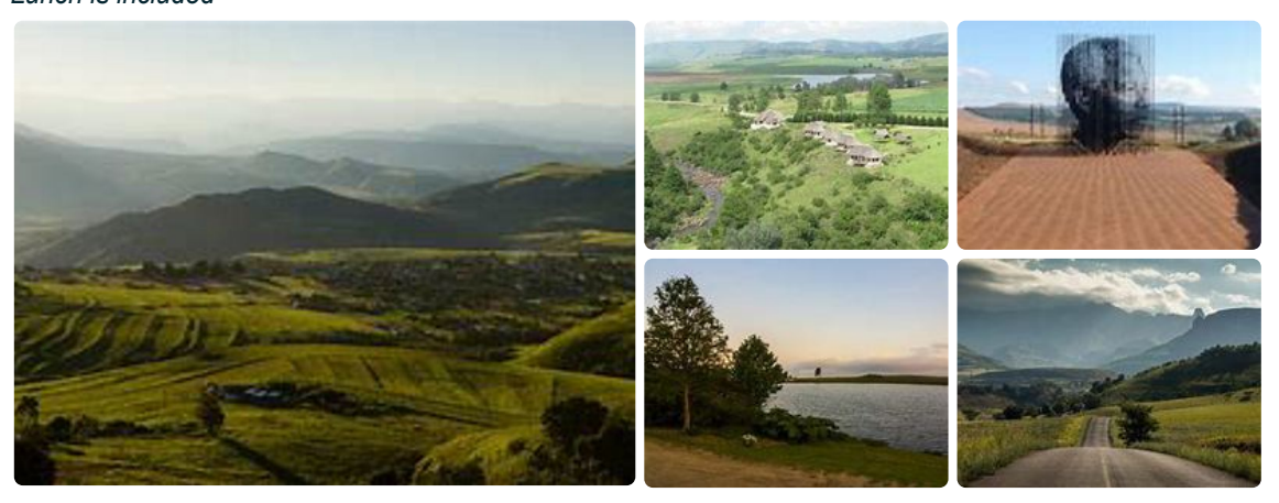
Lunch is included

The Tour is a scenic journey through the picturesque Midlands region of KwaZulu-Natal, South Africa. It's known for its rolling hills, lush countryside, and charming villages dotted with art galleries, craft shops, and eateries. Visitors can explore the area's artisanal crafts such as pottery, weaving, and woodworking, often meeting local artists and craftsmen along the way. The tour also includes visits to historical sites, farm stalls offering local produce, and opportunities for outdoor activities like hiking and horse riding. The Midlands Meander is a delightful blend of art, culture, and natural beauty, perfect for a leisurely day trip or longer exploration.